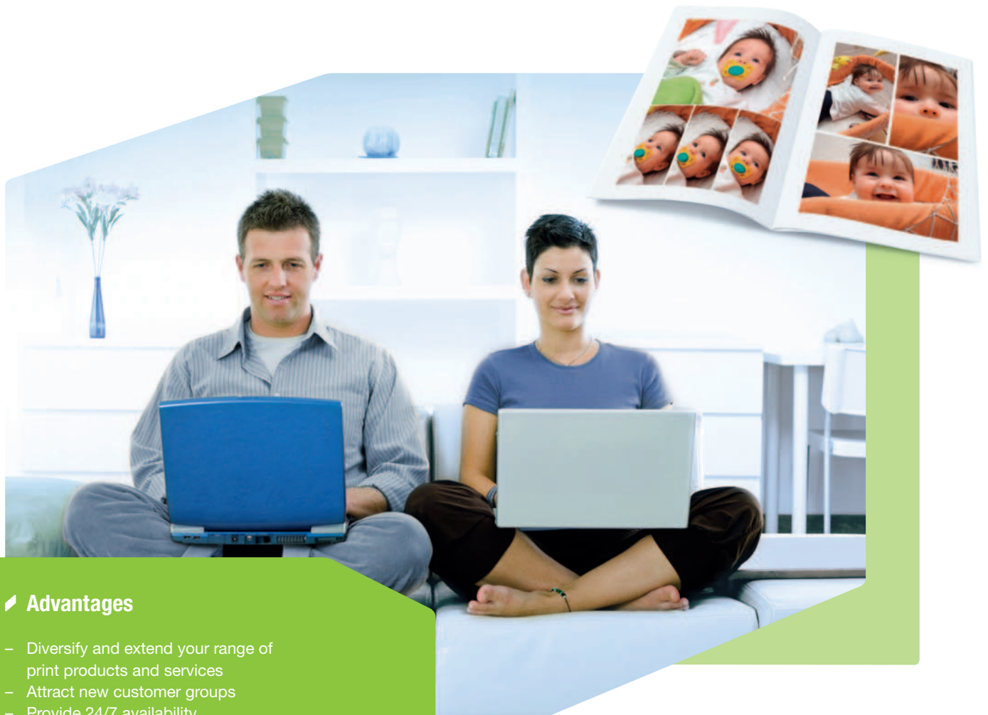
Photo book creation is an easy and attractive enhancement of your online print offering. Via a photo book application, you provide your customers with easy yet extensive online layout possibilities to create albums or calendars with their photos of holidays, events and other occasions. Similar to other web-to-print applications, photo book software includes online submission, payment and tracking, right down to the final delivery or collection of the printed photo book.

“Expand your services and grow your revenue.”